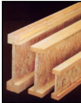
Above: Sample I-joists

At UCS, we are constantly committed to meeting the needs of an ever evolving industry. Because of new building codes many of our design/build partners have asked about new options for our roof deck. To meet this need, we are introducing a new I-joist roof deck, which will now be available in addition to our typical