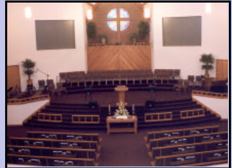
Above: The sanctuary of Brookhaven Wesleyan Church