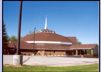
Above: Brookhaven Wesleyan Church Marion, Indiana.

UCS's clients are always celebrating something exciting. The following churches are no exception.