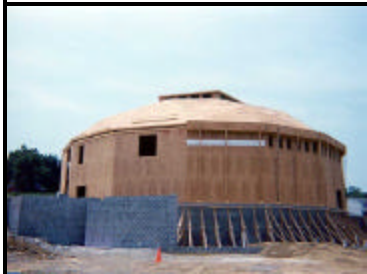
Above: Corinth Baptist Church Capitol Heights, Maryland